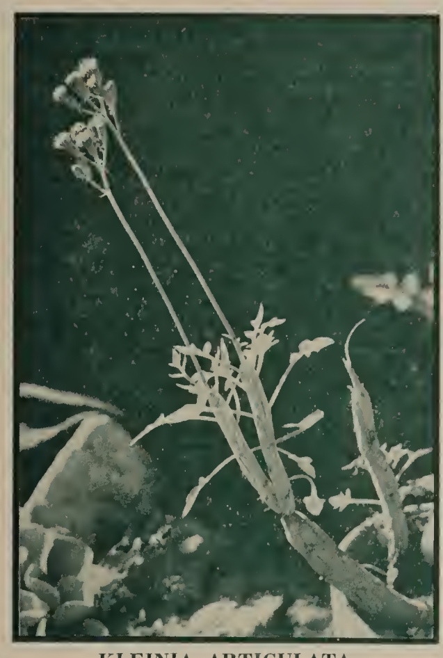
KLEINIA ARTICULATA One of a queer genus of plants from Africa

One each of any 6 marked with asterisk, $1.00, postpaid.